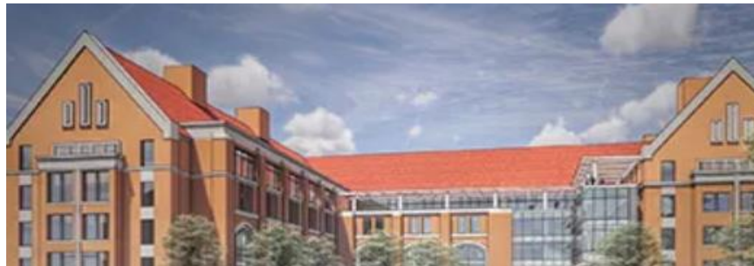
HASLAM COLLEGE OF BUSINESS EXPANSION | ANNOUNCED SOON