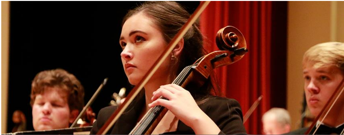
COLLEGE OF MUSIC