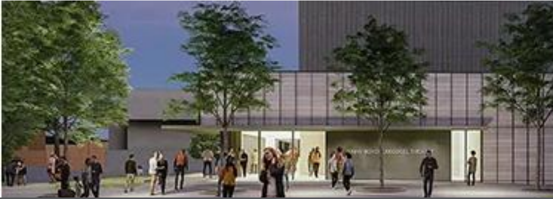
JENNY BOYD CAROUSEL THEATRE | FALL 2025