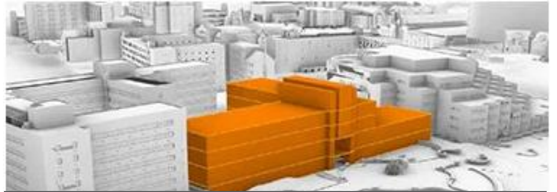
STUDENT SUCCESS BUILDING | FALL 2026