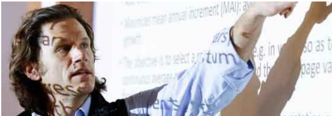
BAKER SCHOOL OF PUBLIC POLICY AND PUBLIC AFFAIRS