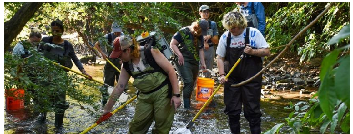
SCHOOL OF NATURAL RESOURCES